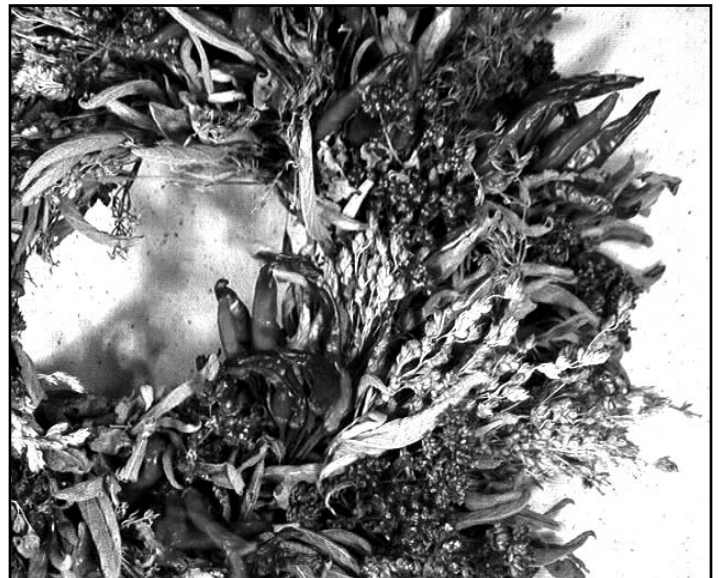
These kitchen wreaths may be made with Garden Sage, Thyme, Nippon Taka Chili peppers, Oregano and other herbs. The 12"-13" wreath is undoubtedly a culinary work of art. It can be hung decoratively or, if you can bring yourself to disturb its perfection, the herbs could be pinched to be used in cooking.

This workshop is limited to 12 people and we suggest that you sign up early to ensure a space. COSTS: $45.00 per person. The cost includes the class, all materials for the project, and a light lunch prepared at the farm. CLASS TIMES: 9:30 until 3:00. REGISTRATION: Register in person, by phone, by mail, or by e-mail.