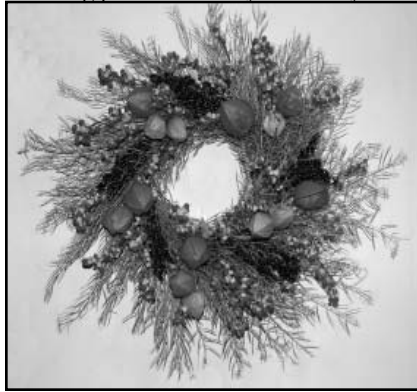
Rocket, or Barbarea vulgaris is the delicately sinuous background for Chinese lantern, sorghum, and bittersweet berries.